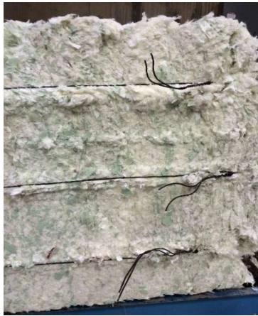
Fig. 1. Close up wires.

GGT-Footing is composed of chopped Geo-Textiles and Fibers. These materials are compressed into 300+ pound bales that are bound together with three metal wires ( Fig. 1 ). The bales are stacked on wooden pallets, two bales wide and 3 bales tall, totaling 6 bales per full pallet. Then each pallet is stretch film wrapped to keep them together. On average, each complete skid weighs between 1,800 – 2,500 lbs, (1 TON+) and is around 7-1/2' tall ( Fig. 2 ). Fig. 2a is a picture of our P41 ¾" Fiber in gaylord boxes (average 1000#/box). Groomers vary in size, the 57" groomer is the only groomer that will fit on a liftgate, all others, a liftgate is not possible, please discuss shipment in detail with your sales representative.