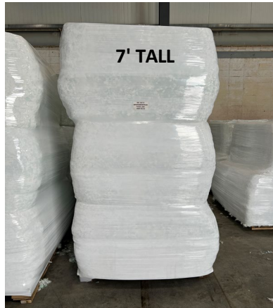
Fig. 2. A complete footing pallet.