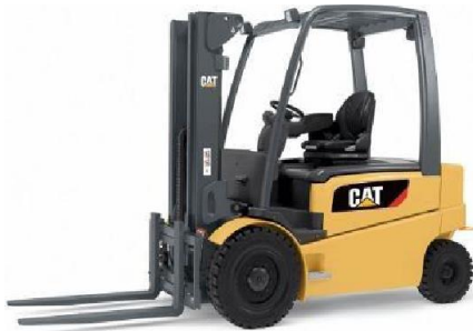
Fig. 6. Forklift