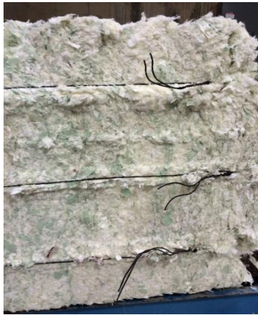
Fig. 1. Close up wires.

GGT-Footing is composed of chopped Geo-Textiles and Fibers. These materials are compressed into 300+ pound bales that are bound together with three metal wires ( Fig. 1 ). The bales are stacked on wooden pallets, two bales wide and 3 bales tall, totaling 6 bales per full pallet. Then each pallet is stretch film wrapped to keep them together. On average, each complete skid weighs between 1,800 – 2,500 lbs, (1 TON+) and is around 7-1/2' tall ( Fig. 2 ). Fig. 2a is a picture of our P41 ¾" Fiber in gaylord boxes (average 1000#/box). Groomers vary in size, the 57" groomer is the only groomer that will fit on a liftgate, all others, a liftgate is not possible, please discuss shipment in detail with your sales representative.