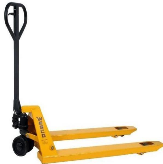
Fig. 4. Pallet Jack

As you can see, these skids can be very large (48"W x 58"D x 92"T)! It is important that you fully understand what to expect at delivery and make arrangements for accepting your order. This ensures a smooth and successful process. Please let us know if delivery will be to a rural area, on a dirt road or an area restricted to tractor trailers as this could be a challenging delivery. Due to liability reasons, the truck