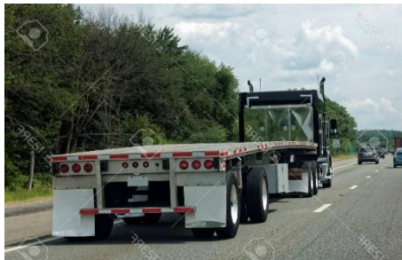
Fig. 8. Flatbed trailer