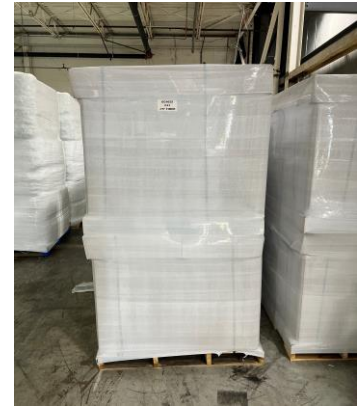
Fig. 2a. P41 fiber pallet (2 boxes)