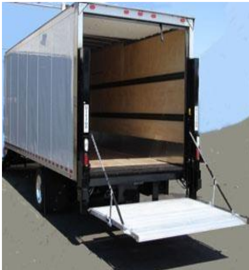
Fig. 3. 28' Pup Trailer with Lift Gate