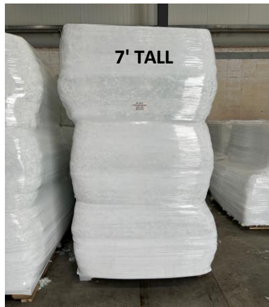
Fig. 2. A complete footing pallet.