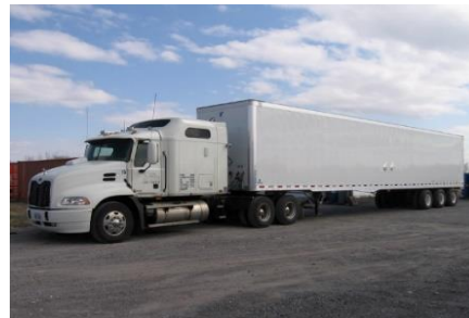
Fig. 9. 53' Dry Van

Once your order arrives, please make note of any damage during transport and contact your salesperson immediately. Note any damage on the carriers POD (Proof of Delivery). This ensures we can file a damage claim, if necessary. A damage claim MUST be filed within 5 days of delivery.